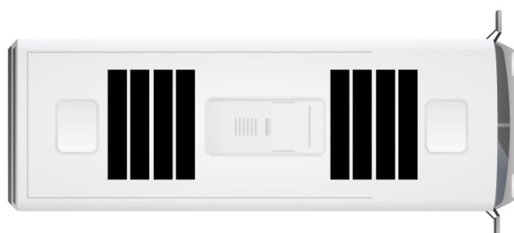
Illustration only as an example